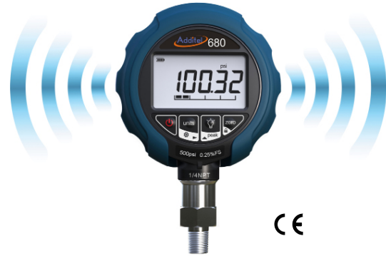
680 with data logging and wireless (optional)